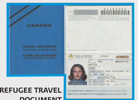
REFUGEE TRAVEL DOCUMENT