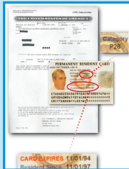
NOTICE OF ACTION (INDICATING EXPIRED RESIDENT CARD IS EXTENDED)