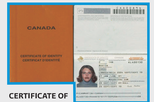
CERTIFICATE OF IDENTITY