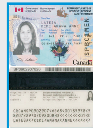
PERMANENT RESIDENT CARD