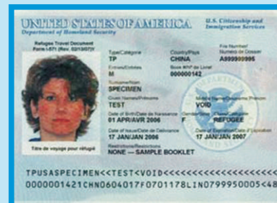
REFUGEE TRAVEL DOCUMENT