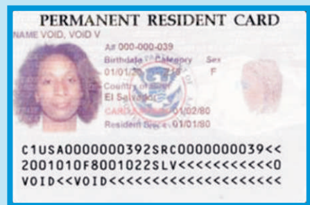
PERMANENT RESIDENT CARD